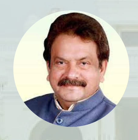
Prof. S.P. Singh Baghel Hon'ble Minister of State, Ministry of Law & Justice, Govt. of India