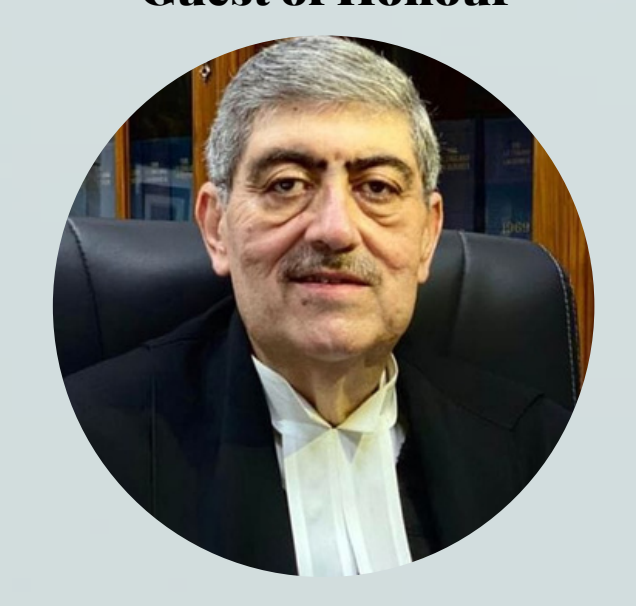
Hon'ble Mr. Justice Sanjay Kishan Kaul Judge Supreme Court of India