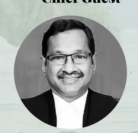
Hon'ble Mr. Justice M.M. Sundresh Judge Supreme Court of India